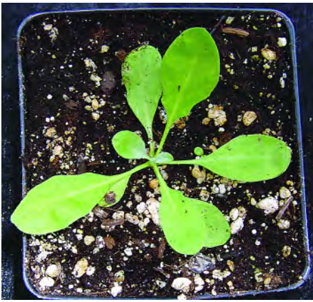
Hoary alyssum seedling.