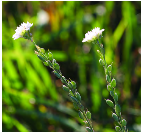
Hoary alyssum seed pods.