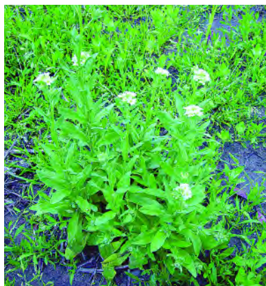
Hoary alyssum flowering plant.

Hoary alyssum can exist as an annual, biennial or short-lived perennial that reproduces only by seed. It emerges early in the spring and is capable of producing seeds until frost. The stems, leaves and fruit of hoary alyssum