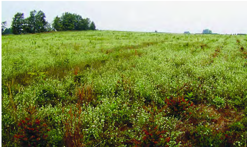
Hoary alyssum flowers.

Many pastures and hayfields grown for horse consumption are commonly grass-legume mixtures. Unfortunately, there are no herbicides labeled for control of broadleaf