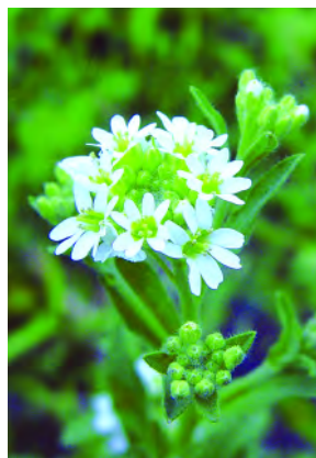
Hoary alyssum flowers.

are covered with gray, star-shaped hairs that give the plant a grayish green appearance. The name “hoary” denotes the gray hairs covering all parts of the plant.